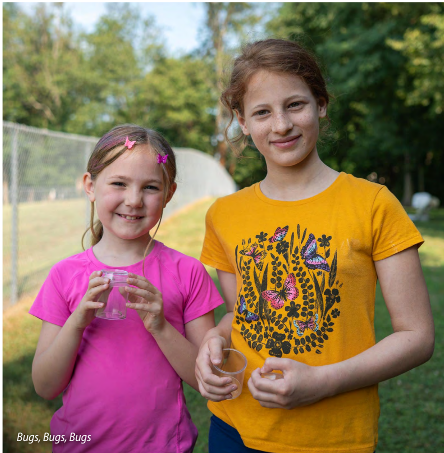
Bugs, Bugs, Bugs

7932 Opossumtown Pike Frederick, Maryland 21702