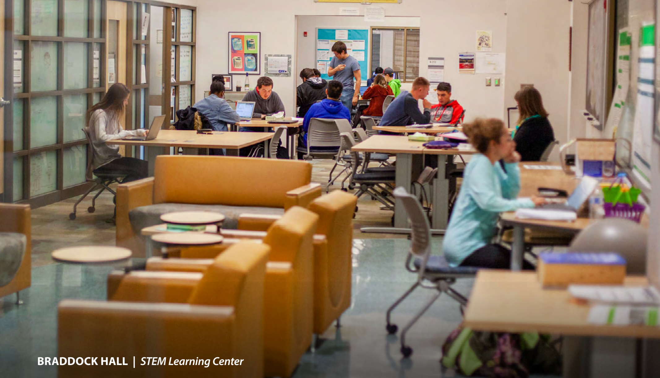
BRADDOCK HALL | STEM Learning Center